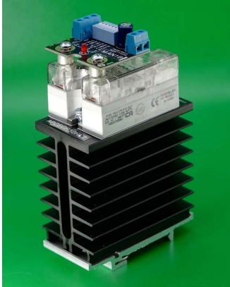
Dimensions: 3.0" x 1.75" x 4.80"

Anacon's "Cool One" heat sink design is by far one of the most unique ideas to come along in quite some time. Read about its amazing features and how Anacon can help with your design regardless of whose Solid State Relays you're using. "Cool One" works better!