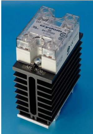
IP20 DIN Relay Integral Touch Safe Cover