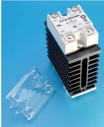
IP00 DIN Relay Removable Touch Safe Cover

Anacon's "Cool One" heat sink designs provide a thermally optimized DIN mounting platform for today's high performance solid state relays. The listings below provide the actual load currents that each part type will support. If you're not sure about how to select the correct product for your application, call Anacon, toll free and discuss your application with us.