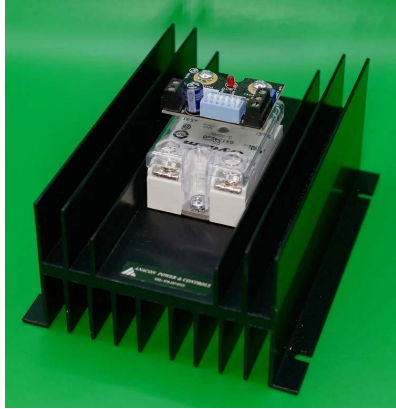
Dimensions: 6.0" x 4.75" x 3.0"

Anacon's "Cool One" heat sink design is by far one of the most unique ideas to come along in quite some time. Read about its amazing features and how Anacon can help with your design regardless of whose Solid State Relays you're using. "Cool One" works better!